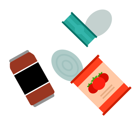
metal cans, pots and pans