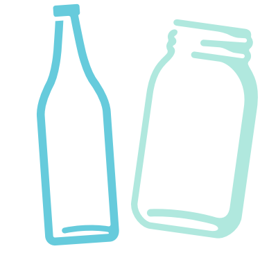
glass jars and bottles